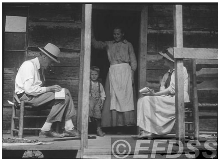
Cecil Sharp and Maude Karpeles used by permission from the English Folk Dance and Song Society

Mr. Sharp may have had a somewhat romantic notion of rural life, but these words could have just as easily been written by a 21st century Lutheran cantor as an early 20th century song-catcher. The instances of actual tone-deafness (congenital amusia) are vanishingly small; every human being can sing, and it is indeed silly to imagine otherwise. There are plenty of places in our culture that mirror Sharp's England; where music is considered the domain of professionals, and "normal" people are expected to keep quiet and listen.