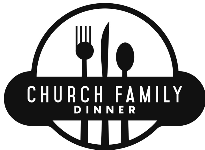
Table for All provides an opportunity for you to meet and get to know more people at St. Mark's. Over the course of the year, you'll have the opportunity to gather with 3 different groups at people's homes to break bread and share in conversation. It's a fun and easy way to get to know your church family better, and build stronger relationships (all while enjoying some yummy food!).

As an addition to our fellowship ministry here at St. Mark's, we invite you to participate in a way for individuals or couples to share meals with your fellow parishioners.