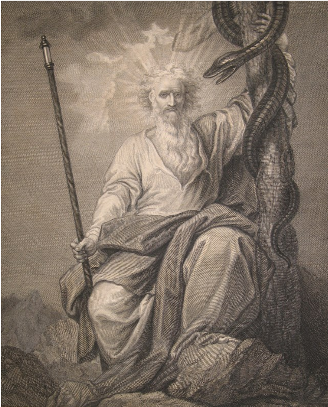
Moses, from The Macklin Bible

The Macklin Bible is an enormous physical specimen of book art, comprising seven volumes two feet in height and over 130 pounds in weight. It is the apogee of the art of British copper-plate engraving. Renowned artists often selected scripture texts that featured women, who were the nurturers of religious education for the family in late 18th century England. This powerful image of Moses by Benjamin West presents the Moses written of in the book of Numbers, chapter 21, verses 4-9. From Art in the Christian Tradition, a project of the Vanderbilt Divinity Library, Nashville, TN.