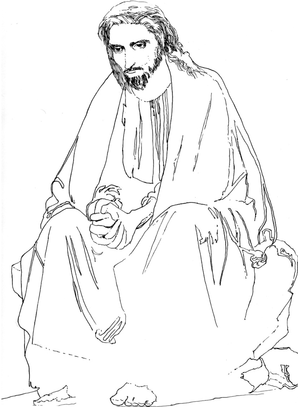
Christ in the Wilderness

Kramskoï, Ivan Nikolaevich, 1837-1887, from Art in the Christian Tradition, a project of the Vanderbilt Divinity Library, Nashville, TN. http://diglib.library.vanderbilt.edu/act-imagelink.pl?RC=54213 [retrieved February 15, 2021]. Original source: http://www.flickr.com/photos/duckmarx/402675938/ .